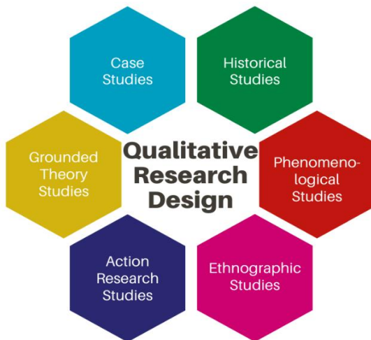
Figure 2: Qualitative research design

Research design helps researcher to gather information and knowledge related to a subject matter. Every research work has aims and objectives and researcher has a responsibility to achieve those aims in a significant way. These individuals use “qualitative” research design for this particular study. A unique way of research process is maintained by a researcher with help of this “qualitative” research design [7]. Researcher can easily solve any complex subject matter by this research design. These individuals provide better answers to research questions significantly. In depth interviews, observations and focus group discussion are three important functions of qualitative research design. This qualitative research design helps research participants to access thoughts and feelings of researcher [8]. Different knowledge and information related to a subject matter is gained by qualitative research design. Researcher follows a secondary research type for this study to gather existing data. Online journals, websites and channels are used by these individuals to collect relevant data related to a subject matter.