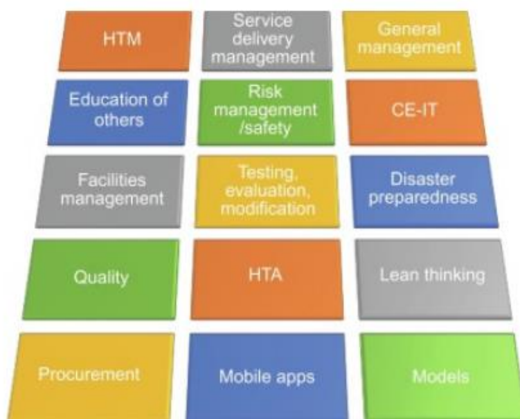
Figure 1: Role of clinical engineering

Hospital-based clinical development can happen with major planning processes and this happens with proper assessment of technological development. There should be proper action which has been taken for assuring technological compliances. In medical technological management, investigation of incidents and active participation is getting under the proper management and active participation of every employee [14]. In this concern, medical device design is an important aspect that can form huge implementations of the medical instruments that can make better approaches in medical processes and operations. These activities have particular scope that help in better management and particular training that can form better performance which is integrated into the system. This is the line between the medical communication and information system that can make proper continuation of technical upgradation.