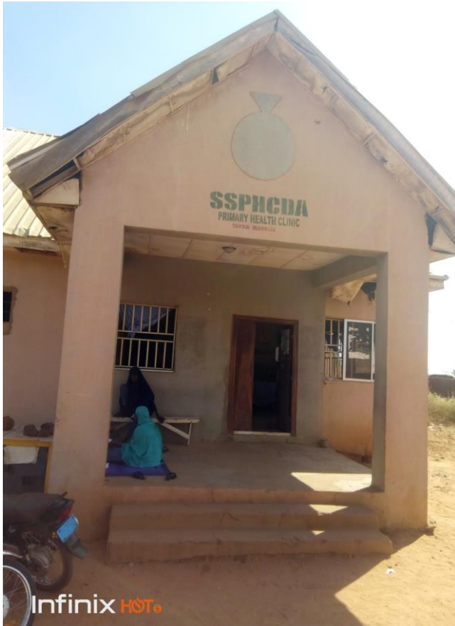
Figure 1: A typical Primary healthcare in Gwadabawa where data was collected; Source: Field work