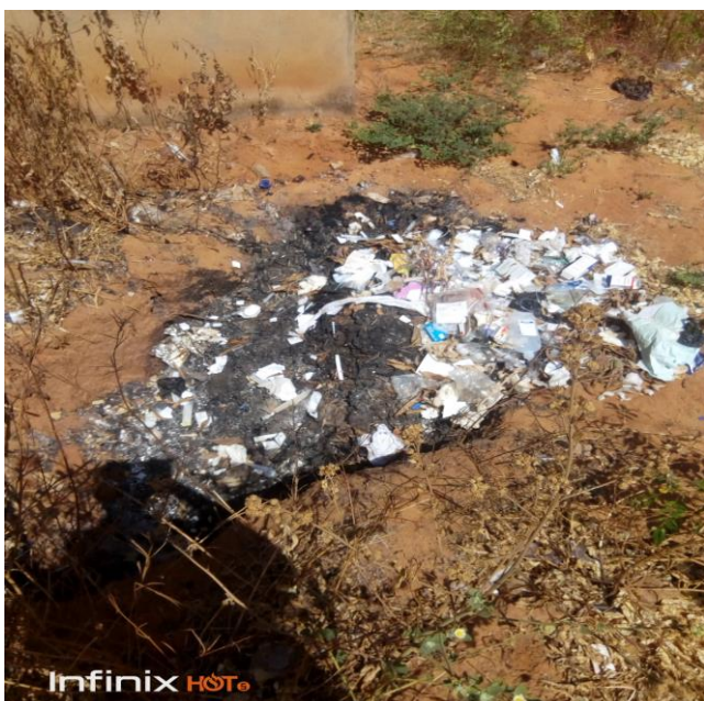
Figure 2: An open biomedical waste dumping site in Gwadabawa